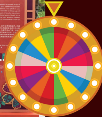
Zodiac Panel & Quiz