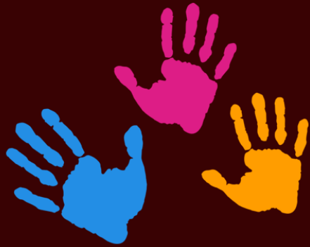
Hands on Activity