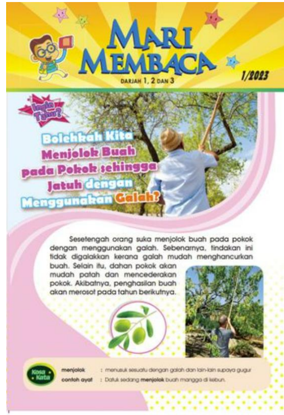
Mari Membaca Magazine