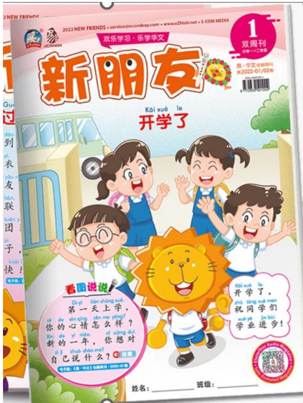
Xin Peng You Magazine