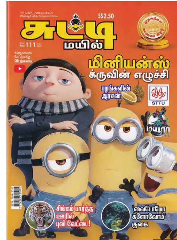
Sutti Mayil Magazine