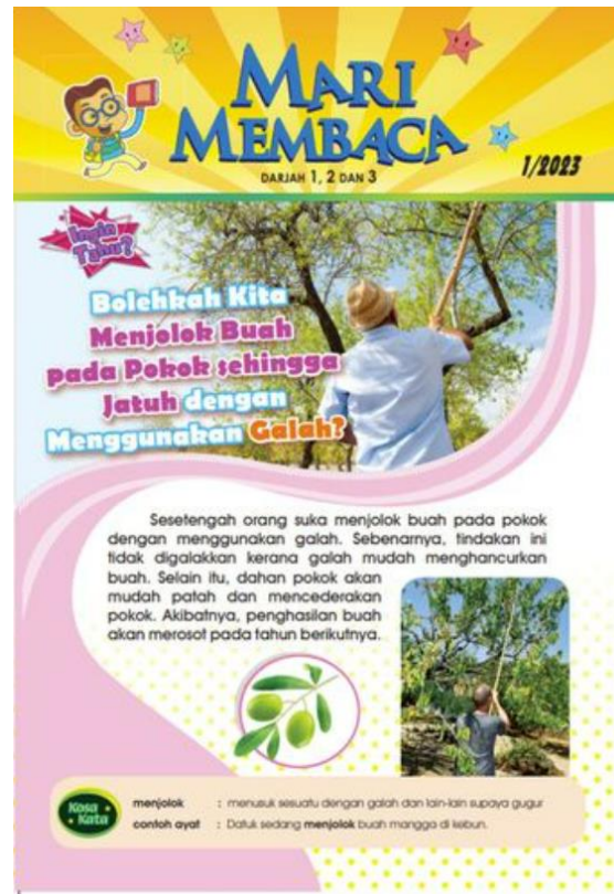
Mari Membaca Magazine