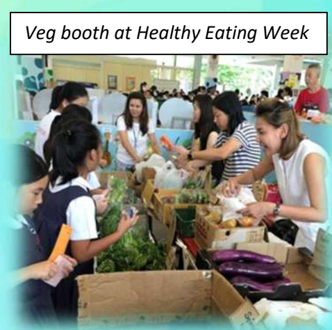
Veg booth at Healthy Eating Week