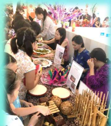
Malay craft work on Racial Harmony Day

Join our Parent Volunteer Group (PVG) as members now, so you get to connect with other parents and experience first hand for yourself the culture and vibrancy of the RGPS community!