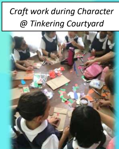
Craft work during Character @ Tinkering Courtyard