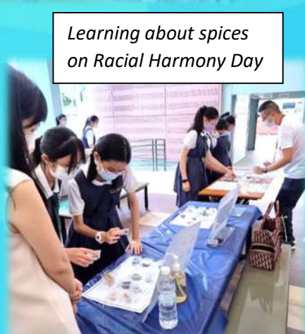
Learning about spices on Racial Harmony Day

Membership fees will be a one time fee of $60 per child which will cover all 6 years of your child's study at RGPS. All proceeds go towards funding of activities for the benefit of our girls. Volunteering opportunities on a no-obligation basis are available on both regular programmes and ad-hoc activities, so you get to decide on your level of involvement.