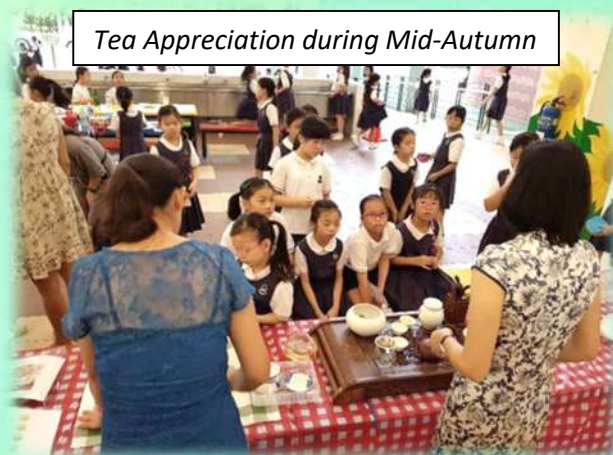
Tea Appreciation during Mid-Autumn