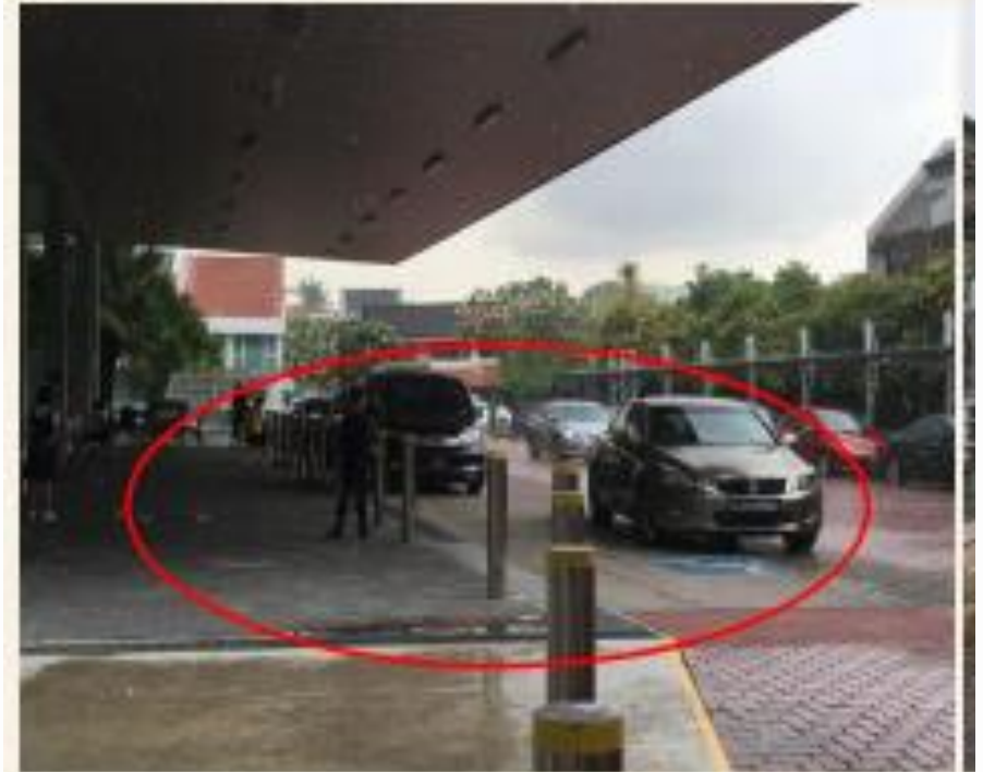
Canteen Pick Up Point for P1-P4