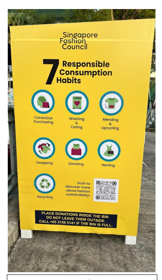
7 Responsible Consumption

Thank you for your support in our school's direction to 'Get Green and Love Earth'.