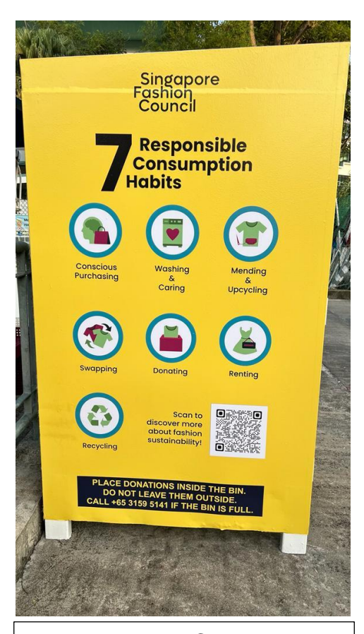
7 Responsible Consumption

Thank you for your support in our school's direction to 'Get Green and Love Earth'.