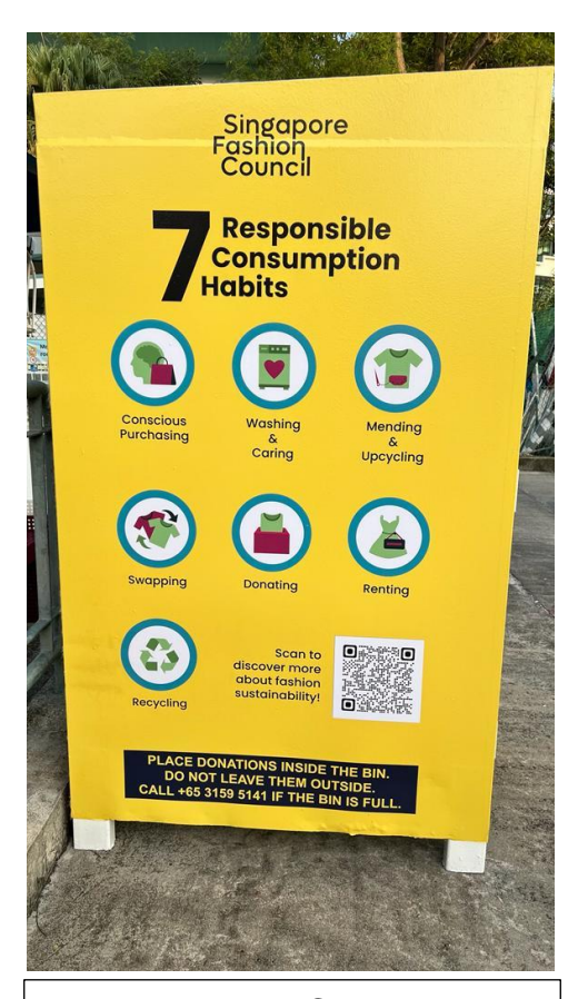
7 Responsible Consumption

Thank you for your support in our school's direction to 'Get Green and Love Earth'.