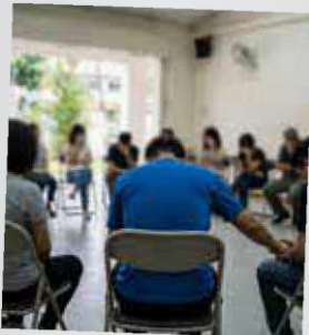
RIPPLES OF IMPACT*

Learn to spot early warning signs & gain the skills to turn difficult conversations into opportunities for connection.