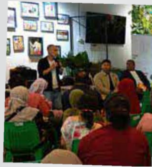
THE HUMAN STORY BOOK*

An interactive workshop where you're more than just a passive listener. Empathise with and affirm the stories shared by former drug users and their loved ones, and be part of their restorative process.