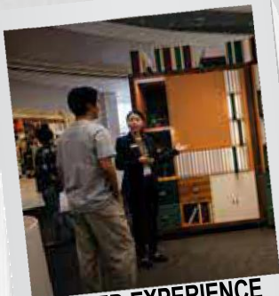
GUIDED EXPERIENCE OF RYAN'S STORY*

Kintsugi is the Japanese art of repairing broken pottery with gold. Learn the art of mending, reflecting on imperfection, and what finding beauty in brokenness means.