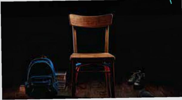
MY WORLD WITHOUT YOU*

Your words can be their lifeline. This interactive experience equips parents, educators and mentors with the tools to navigate the challenges of youth drug abuse.