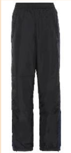
Trackpants – for safety reasons