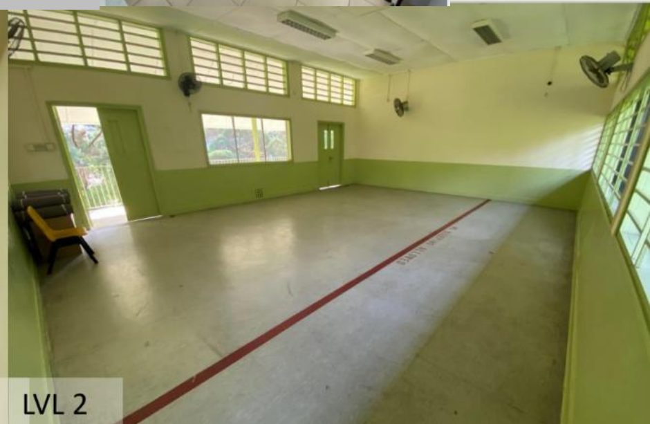
LVL 1 LVL 2